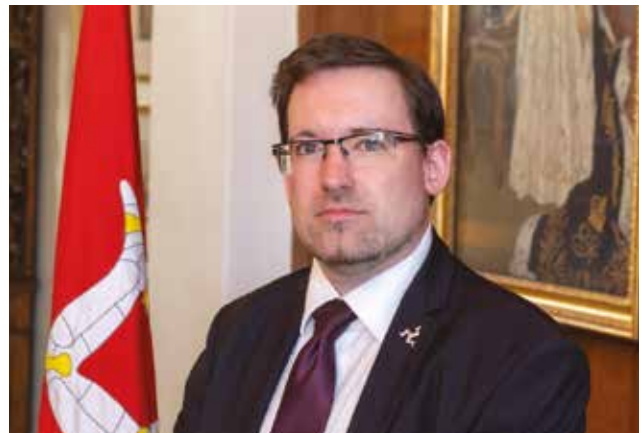
HON. LAWRIE HOOPER MHK MINISTER FOR ENTERPRISE

Digital technology impacts all sectors of the economy. Its power to drive positive change can be seen most clearly in FinTech where it has transformed the evolution of the finance sector which for decades has been the foundation stone of the Isle of Man's reputation as a leading international business centre.