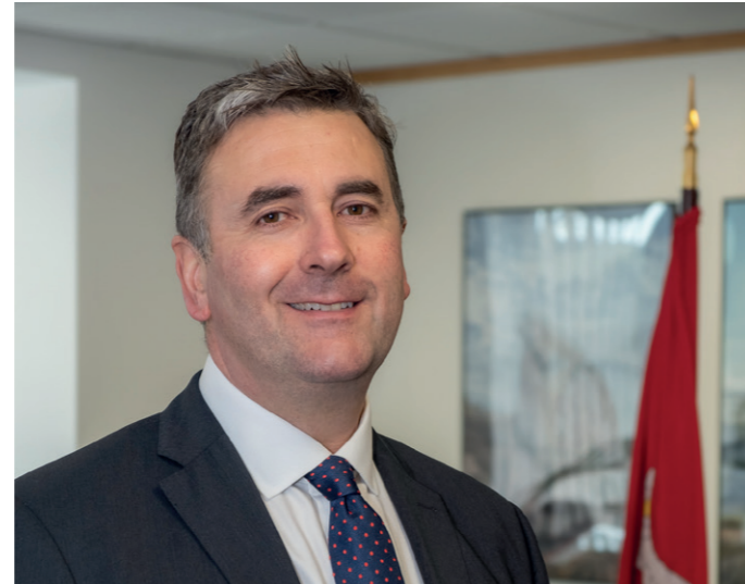
HON. TIM JOHNSTON MHK MINISTER FOR ENTERPRISE

It is important to recognise that the digital sector, and the many innovations being developed each day, are key to our economic resilience and sustainability in the long term. The sector's potential lies not only in its role as a catalyst for job creation and skill development, but also in its capacity to generate income and prosperity.